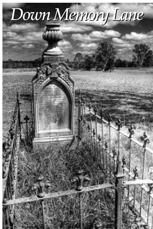
Down Memory Lane