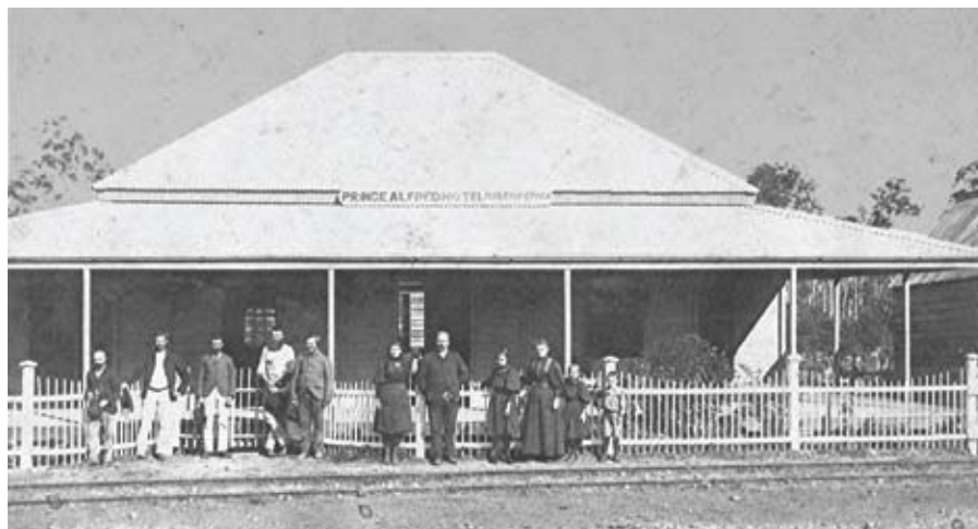
The second Prince Alfred Hotel (Halfway House), burned down in 1894. The present pub boasts the area's longest continuous liquor license since 1867.

19 Dec 2009. Q150-Horse drawn Cobb &Co Coach will take 1875 coach route from Kilkivan, via Gundiah Pub to Maryborough. FCSS 4123 5311.